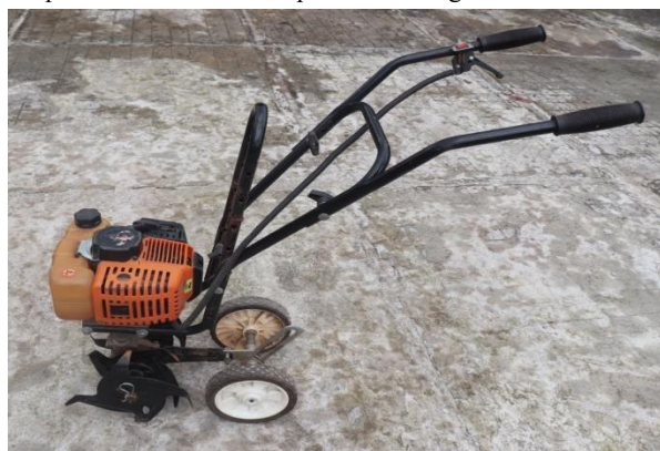
Mini power weeder

The specification of the mini power tiller is given in Table 1.