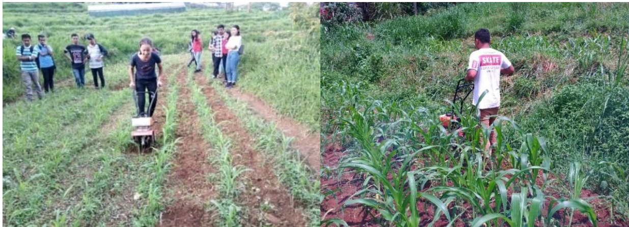
Figure 2: Evaluation of mini power weeder on terraces