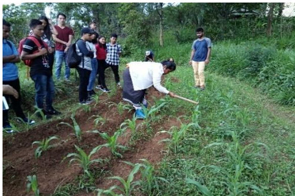
a. Weeding with spade