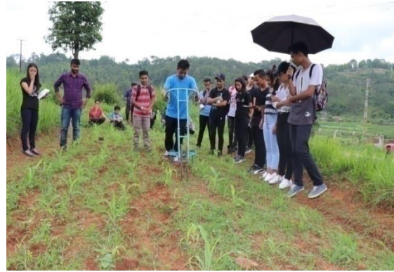
d. Wheel hoe (one tyne)