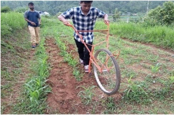
c. Cycle tyre hoe