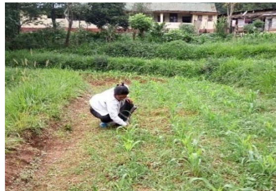
b. Hand weeding